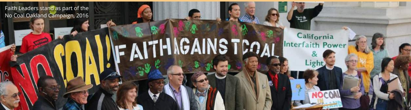
Faith Leaders stand as part of the No Coal Oakland Campaign, 2016

The covenant can be signed at www.interfaithpower.org/welcome where there are further ideas and resources for specific actions your congregation can take.