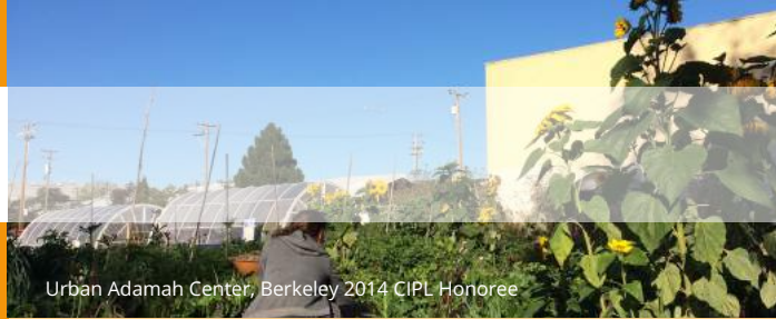
Urban Adamah Center, Berkeley 2014 CIPL Honoree