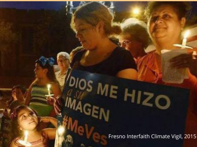
Fresno Interfaith Climate Vigil, 2015

By becoming a member of CIPL, your congregation will have access to a variety of resources and the wisdom of a diverse network of faith leaders to support you. To join the movement you can go to our welcome page and sign the congregational covenant included in this brochure.