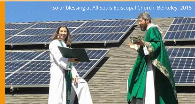
Solar blessing at All Souls Episcopal Church, Berkeley, 2015

The covenant can be signed at www.interfaithpower.org/welcome where there are further ideas and resources for specific actions your congregation can take.